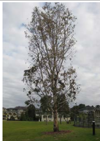
The dying tree in our park

It is planned to replace it with a similar specimen but mature tree.