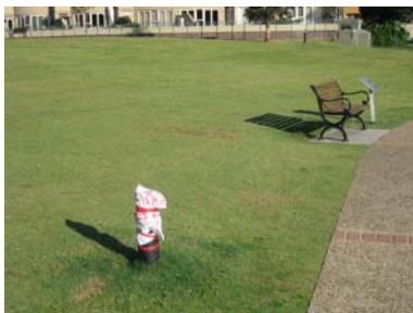
One of the damaged lights along the foreshore

Vandals have been at it again destroying several of the foreshore lights along our pathway.