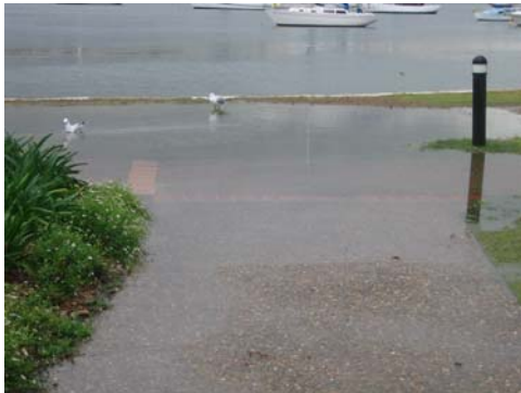
Seagulls enjoying the new pond next to Flinders. Access along this pathway was only available to ducks & barefoot walkers.

The rains finally came to the inner west of Sydney with the deluge beginning on the evening of Thursday 7th September. The torrential rain continued for the next few days and as recorded at the official Bureau of Meteorology gauge at Abbotsford Cove, we received almost 200 millimetres or 8 inches of rain. Unfortunately, without catchment or storage facilities at the Cove, it simply ran into the harbour. The main beneficiary of this local rain has been our gardens and lawns. Our contractors, Starline, had fertilised all of our gardens during August, so the rain was very timely and the results are now showing.