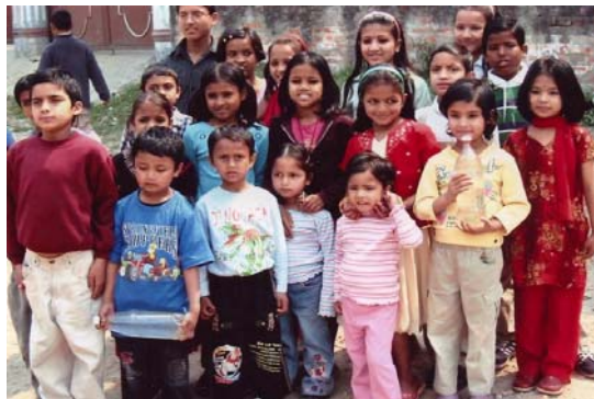
Sponsored children from the orphanage

Nola linked up with the Human Research Support team in Nepal and with generous support, now sponsors 18 children in Tinkune.