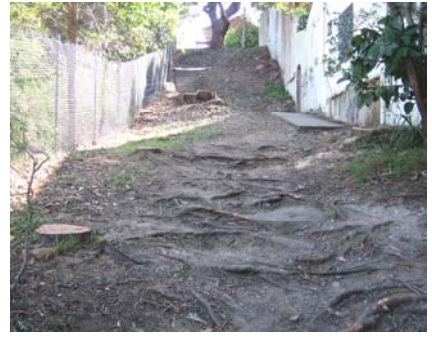
Montrose Reserve harbour access photos show before & after tree removal

The house in Walton Crescent which adjoins the walkway, has now been sold and it is believed it will become a new development site.